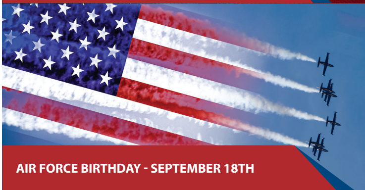
AIR FORCE BIRTHDAY - SEPTEMBER 18TH