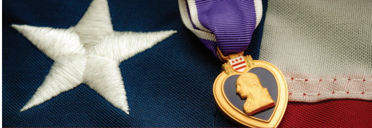
PURPLE HEART DAY - AUGUST 7TH

Satisfy your pizza cravings with the Happy Hour Pizza event! Swing by all the office locations from 2:00 to 4:00 PM to pick up a delicious slice of pizza. This is the perfect opportunity to enjoy a quick and tasty snack during your afternoon break. Don't miss out on this convenient and delectable event that will surely bring a smile to your face during Happy Hour!